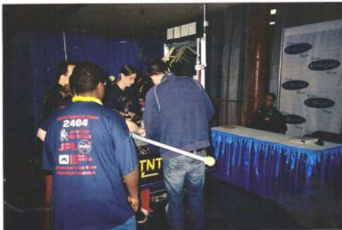
"Dino-Bot," T N T

We want to show the community that if you support us, we can achieve great things.